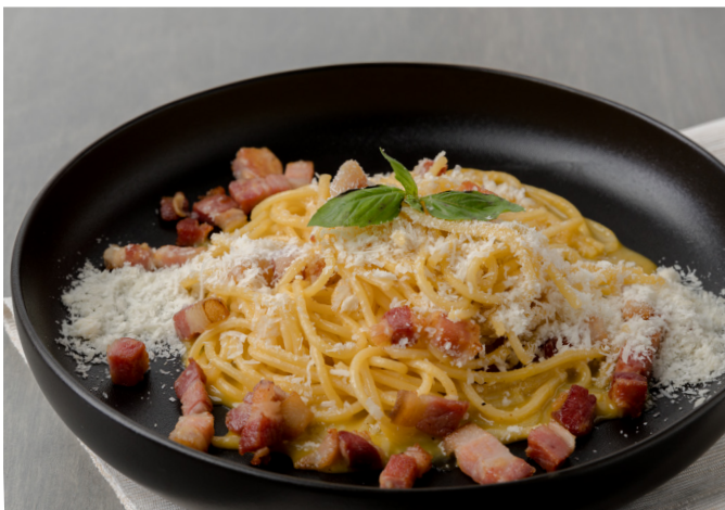
Spaghetti alla carbonara 320 Spaghetti carbonara with smoked pancetta