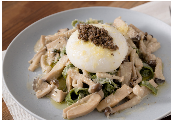
Fettuccine verdi ai funghi e tartufo con burrata 460 Truffle infused cream mushroom sauce over spinach fettuccine topped with burrata