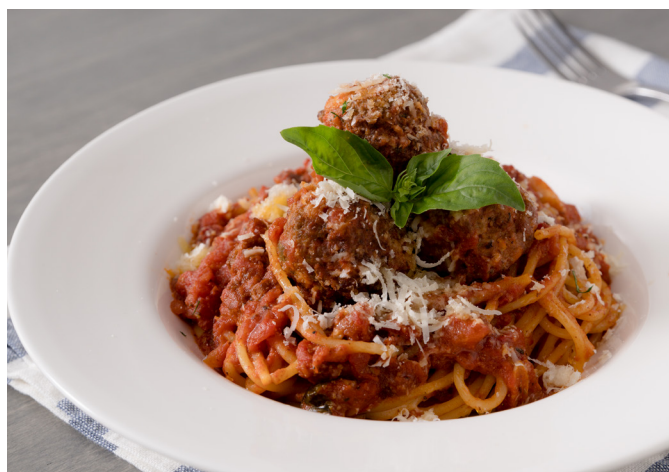
Spaghetti alla Napoletana 350 Spaghetti with Neapolitan style meatballs