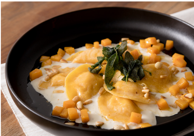
Lunette zucca e gorgonzola 280 Pumpkin lune in gorgonzola cream sauce