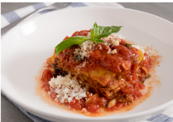
Lasagna Emiliana 380 Traditional Italian lasagna with beef and sausage