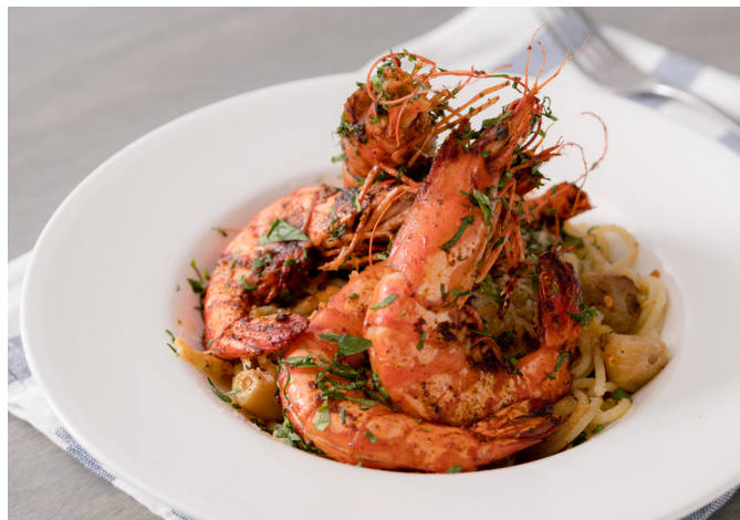
Spaghetti ai gamberi 380 Spaghetti with sautéed prawns, roasted garlic, and extra virgin olive oil