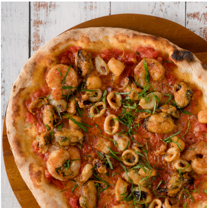
Frutti di mare